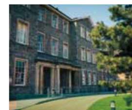
Ashley Down Centre (including our University Centre) Ashley Down Road, Bristol BS7 9BU