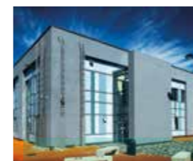
Advanced Engineering Centre (AEC) Parkway New Road, Stoke Gifford, Bristol BS34 8SF