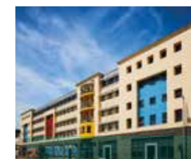
College Green Centre St George's Road, Bristol BS1 5UA