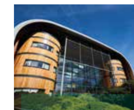
South Bristol Skills Academy The Boulevard, Hengrove Park, Bristol BS14 0DB